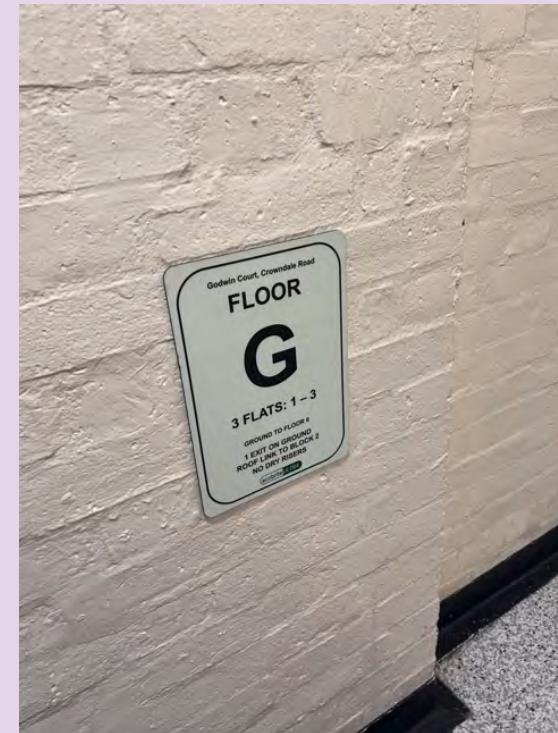
Wayfinding signage at Godwin Court.

Wayfinding signage is a visual communication tool to assist the Fire and Rescue Service in locating specific flats as they navigate their way round a building.