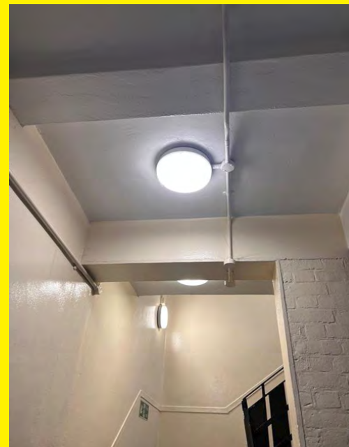
Electrical lighting at Godwin Court

Emergency lighting provides illumination in instances where mains power may have failed. It illuminates escape routes, emergency exit/s and firefighting equipment. It will provide illumination to signage and provide sufficient lighting to help you to escape.