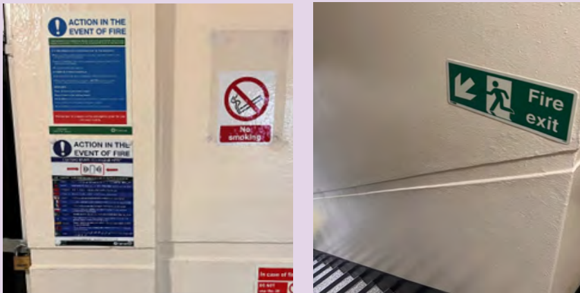
Fire Action Notices and Fire Exit Signs at Godwin Court.

We have installed Fire Action Notices and Fire Exit Signs in your building.