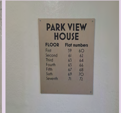
Various wayfinding signage at Park View House.

Wayfinding signage is located on each stairwell landing and by the main entrance.