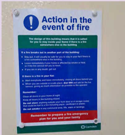
Fire Action Notice beside lift at Park View House.

We have installed Fire Action Notices in your building.