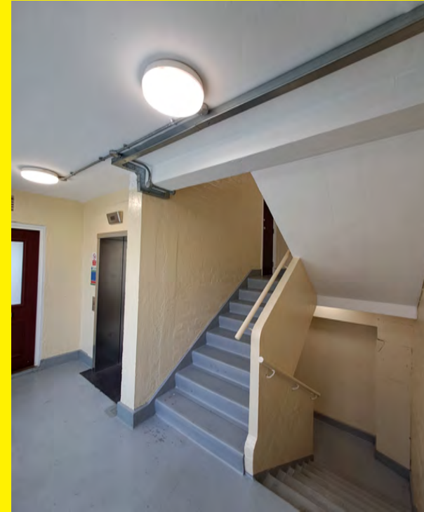
Emergency lighting at Park View House

Emergency lighting provides illumination in instances where mains power may have failed. It illuminates escape routes, emergency exit/s and firefighting equipment. It will provide illumination to signage and provide sufficient lighting to help you to escape.