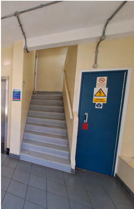
Electrical cupboard fire door at Park View House.