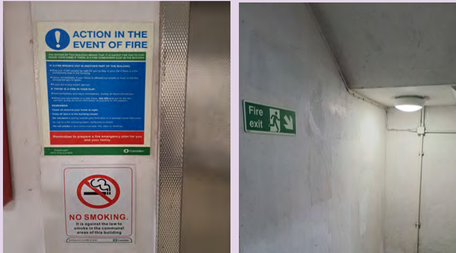
Fire Action Notice and Fire Exit Sign at 1-29 Faversham House.

We have installed Fire Action Notices and Fire Exit Signs in your building.