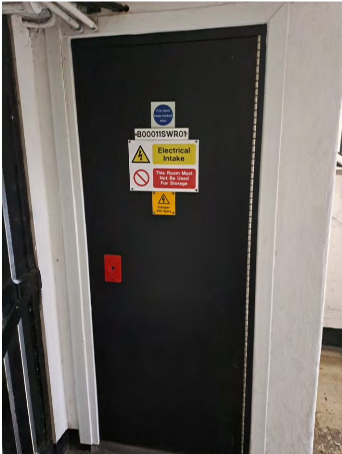
Electrical Intake Cupboard Fire Door at 1-29 Faversham House.

Doors to plant rooms, electrical intake and lift motor rooms (including fire rated hatches or panels)