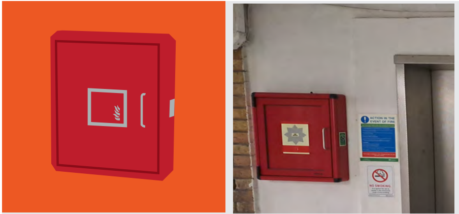
Secure Information Box at 1-29 Faversham House.

Secure Information Boxes are easily identifiable storage units for documents intended for use by the fire and rescue service during a fire.