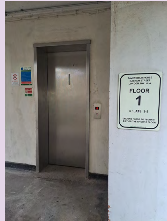
Wayfinding signage at 1-29 Faversham House.

Wayfinding signage is a visual communication tool to assist the Fire and Rescue Service in locating specific flats as they navigate their way round a building.