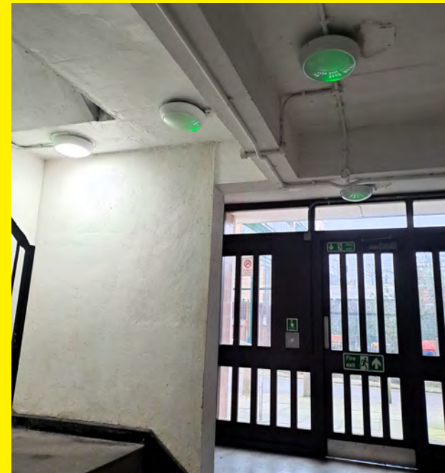
Emergency lighting at 1-29 Faversham House.

An emergency lighting system is generally comprised of self-contained 3hr battery back-up-maintained LED luminaires.