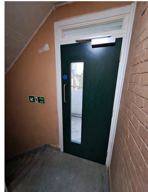
Communal Fire door at 1-29 Faversham House.