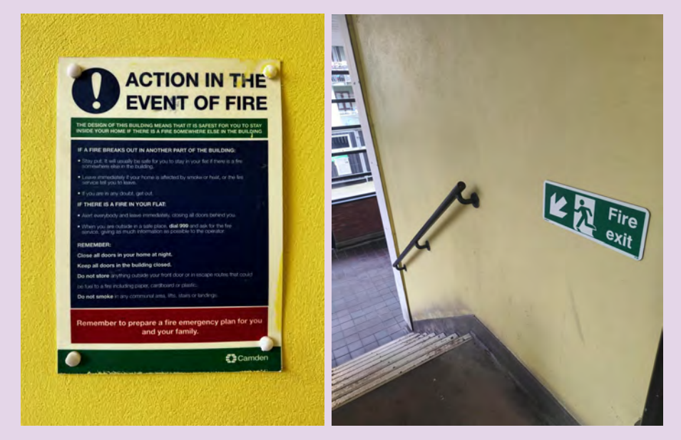
Fire action notice and Fire Exit Sign at 1-25 Fleetway.

We have installed Fire action notices and fire exit signs in your building.