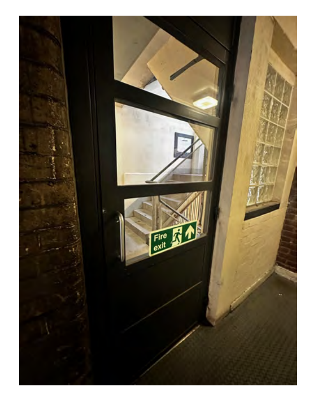
Communal Fire Door at 1-25 Fleetway.