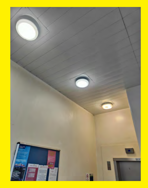
Emergency lighting at Fleetway.

Emergency lighting provides illumination in instances where mains power may have failed. It illuminates escape routes, emergency exit/s and firefighting equipment. It will provide illumination to signage and provide sufficient lighting to help you to escape.