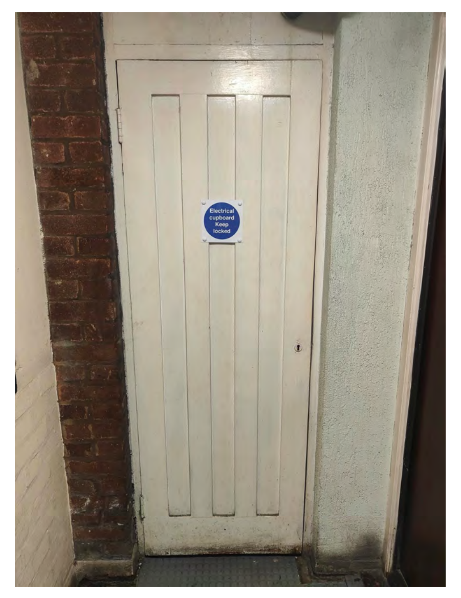
Electrical intake cupboard fire door at 1-25 Fleetway.

Doors to plant rooms, electrical intake and lift motor rooms (including fire rated hatches or panels)