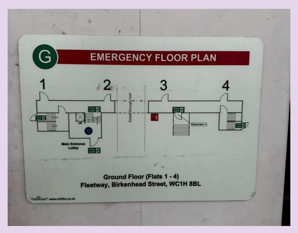
Wayfinding signage at Fleetway.

Wayfinding signage is a visual communication tool to assist the Fire and Rescue Service in locating specific flats as they navigate their way round a building.