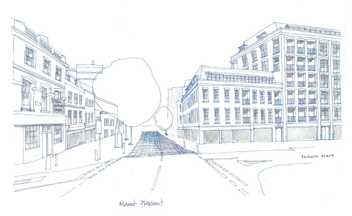
Fig. 7 Image of Mount Pleasant corner with Phoenix Place. Existing listed buildings on the left: Grade II listed Apple Tree Public House in left foreground, with Grade II listed frontages on Mount Pleasant, behind it.

9.3 This sensitivity and continuation of line and character is outlined in the two images below which emphasis the continuity and variety between these two elements: