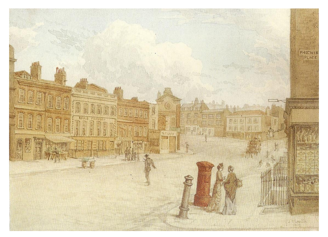
Fig. 6 Painting of Mount Pleasant. Source: <u>http://www.british-history.ac.uk/survey-london/vol47/pp22-51</u>fig.21

9.3 This sensitivity and continuation of line and character is outlined in the two images below which emphasis the continuity and variety between these two elements: