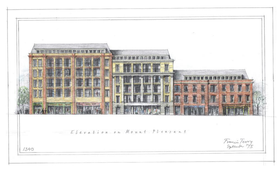
Fig 5 Proposed façade for North of Mount Pleasant

7.7 This judgement is supported by Managing Significance in Decision Taking in the Historic Environment (Historic England, 2015) and Understanding Place: Conservation Area Designation, Appraisal and Management (English Heritage, 2008), which demonstrate the protection and enhancement of setting is intimately linked to townscape and urban design considerations, including the degree of conscious design or fortuitous beauty and the consequent visual harmony or congruity of development.