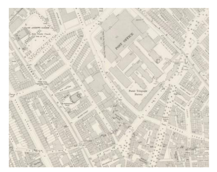
Fig 3. Mount Pleasant in 1893<sup>6</sup>