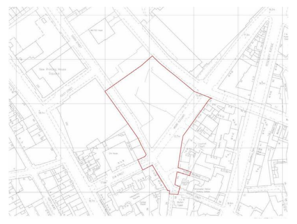
Fig. 1: CRTB Site Boundary

3.1 The CRTBO relates to the development by the Mount Pleasant Association of 125 1, 2 and 3 bedroom flats in a series of 5 linked buildings ranging from 8 storeys (+ lower ground) to 4 storeys, on the area marked on the map below, as part of the MPA's CRtBO submission.