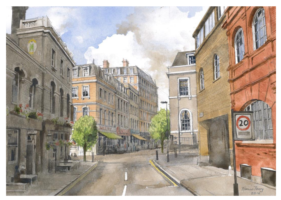
Fig. 8 Image of Phoenix Place corner with Mount Pleasant looking north. Listed public house (the Apple Tree) is on the left immediately before the junction. Beyond the junction on the left is site of CRTBO proposals.