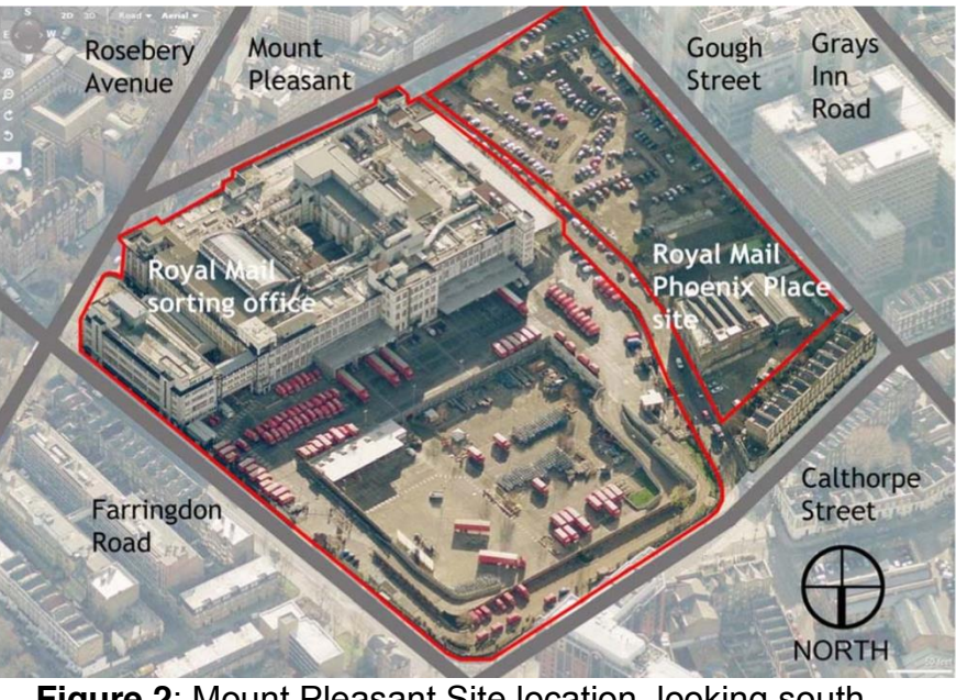
Figure 2: Mount Pleasant Site location, looking south

1.2 The site is 4.8 hectares overall, with 3.6 hectares in Islington and 1.2 hectares in Camden, and is located within the Central Activities Zone, as defined by the Greater London Authority. It is located between the more residential areas to the north, and the more commercial areas to the south. There is a large change of level across the site dropping from north to south.