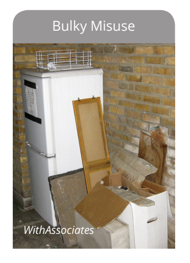
Figure 2: Rented sector waste management issues

Anecdotal evidence from consultation between Resource London and London borough waste officers has suggested that there are a number of waste management issues commonly associated with areas containing a high proportion of rented sector domestic properties - Figure 2.