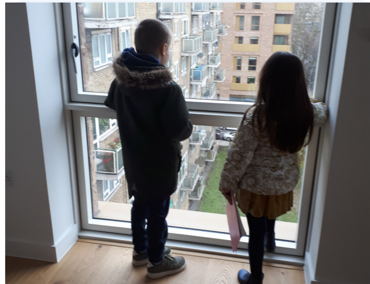
Estate residents looking inside and outside new build homes at Regents Park