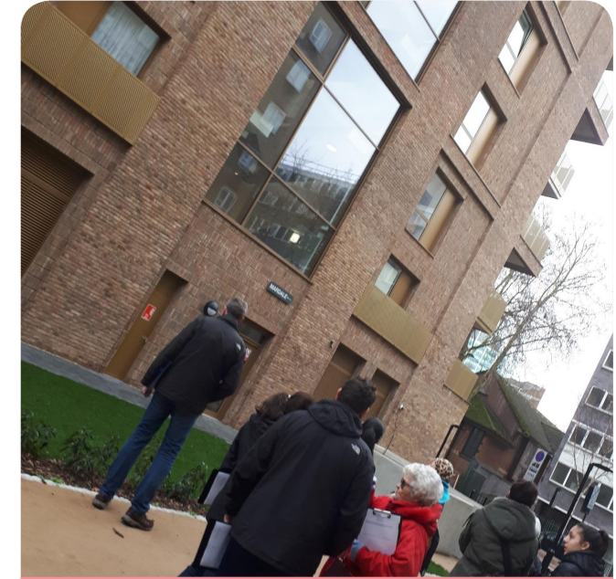
Recent site visit to Regents Park

Camden's Community Investment Programme (CIP) is committed to investing in building and refurbishing council homes, schools and community facilities. Creating new genuinely affordable homes, good quality workspaces and neighbourhoods that are safe and secure. Working in partnership with you, we want to make sure that Camden remains a vibrant, mixed community where everyone has a chance to succeed.